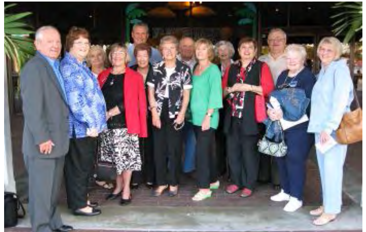
NARFE members in District 11 enjoyed "Singing in the Rain" at their Annual Social at the Broadway Palms in Ft Myers