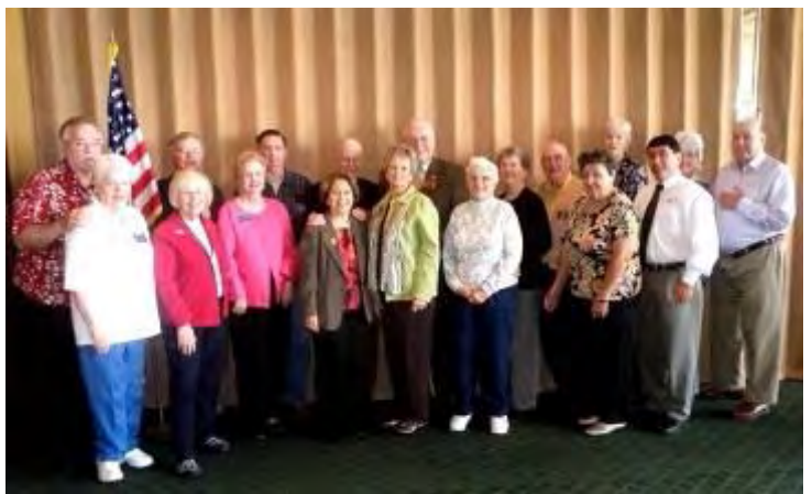
District 1 Annual Meeting