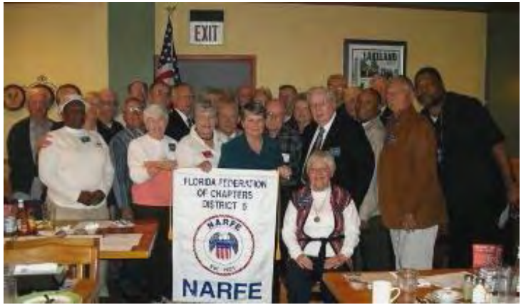
District 5 Annual Meeting