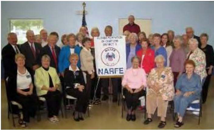
District 11 Annual Meeting