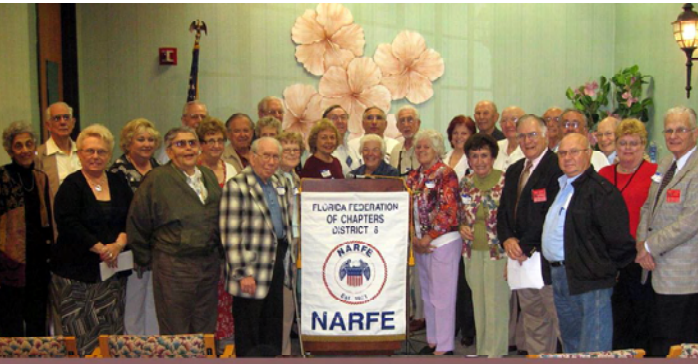
District 6 Annual Meeting