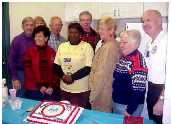
Members of the Strawberry Chapter celebrate it's 37th birthday with a white elephant sale. The chapter made over $700 with the auction which will be donated to Alzheimer's research at the University of South Florida Research Center. The Strawberry Chapter has donated more than $10,000 over the past ten years.