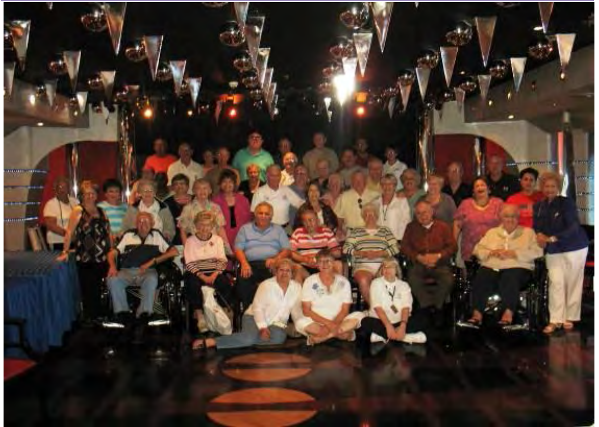
Some of the 78 members and guests on the 2008 Cruise