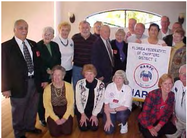
District 8 Annual Meeting