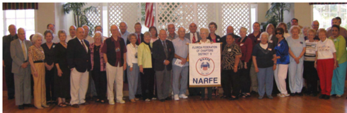
District 9 Annual Meeting

If NARFE did not exist—it would be created!